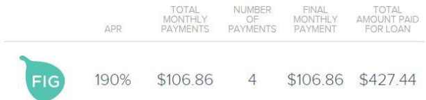
Fig gives you a fair price and a repayment timeline that works within your budget